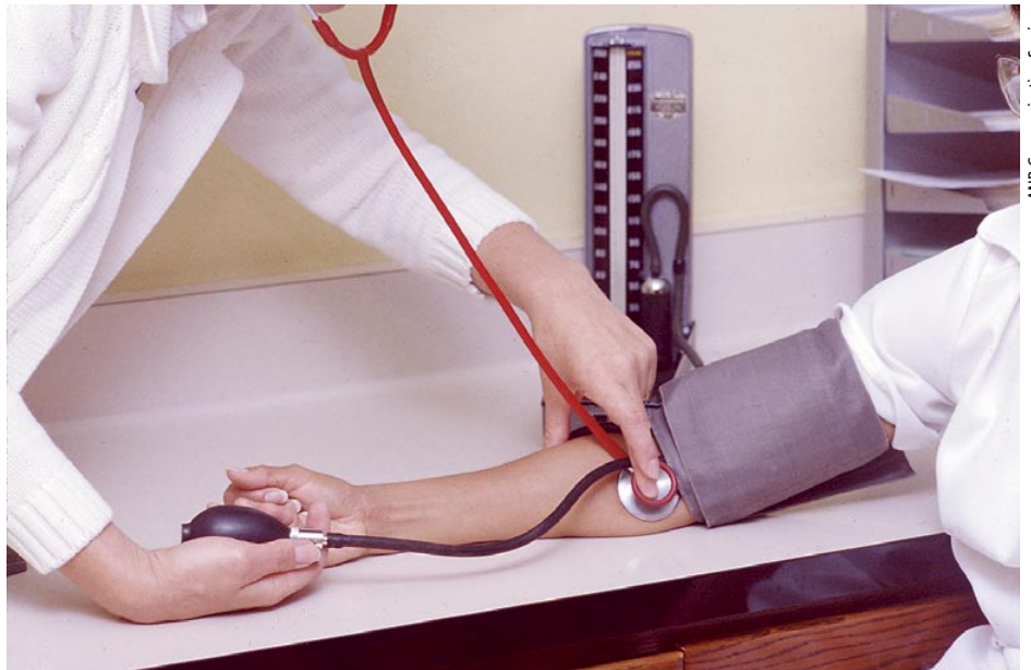
ANR Communication Services

► To establish a cost-benefit relationship, the amount of money saved by delaying a disease or condition for 5 years was estimated. Blood pressure monitoring can help to detect heart disease, hypertension and stroke risks.