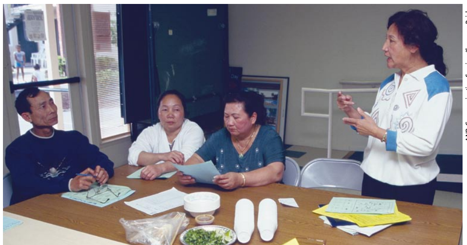
EFNEP provides 4 to 6 weeks of classes in a small-group setting to more than 13,000 low-income California families each year. The program is administered by UC nutrition scientists and educators.

The EFNEP program (in both Virginia and in California) teaches low-income families how to purchase, safely prepare and serve a balanced, highly nutritious diet. The program emphasizes the increased consumption of fruits and vegetables, decreased consumption of fat, and improved skills in food safety, preparation and shopping, with the long-range goal of improved health and risk reduction for chronic diseases. The 1990 Dietary Guidelines for Americans were the basis for instruction during the time of this study (USDA/DHHS 1995), although the recently updated version is currently used. Participants receive intensive nutrition education from