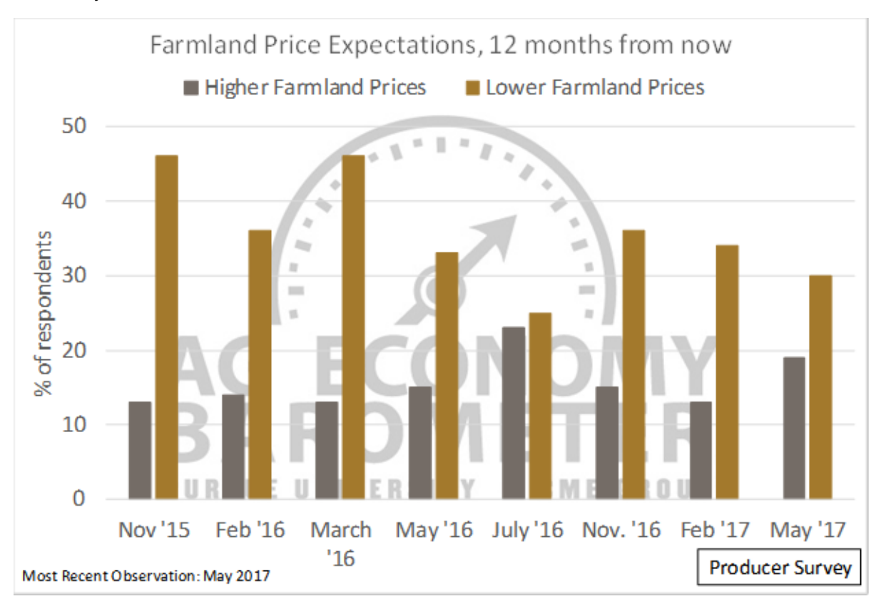
Figure 2. Producers' Farmland Price Expectations from Ag Economy Barometer

monthly Ag Economy Barometer shows that while more producers surveyed expect farmland values to decline over the next year than those forecasting a rise, producers were more optimistic about farmland values in the year ahead than they were in May 2017 – 19 percent of respondents expect an rise, the highest since November 2015 expect for July 2016 (Figure 2). The farm managers and rural appraisers surveyed at lowa State University's Soil Management and Land Valuation conference are forecasting the stabilization in lowa farmland values within the next year and a bounce back before 2020.